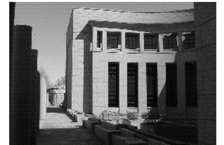
Minnesota Judicial Center, St. Paul

The Supreme Court grants review of approximately 12 percent of the 600-700 petitions it receives each year. The Court hears appeals from the Minnesota Court of Appeals, the Workers' Compensation Court of Appeals, the Tax Court, as well as election matters. The Court also automatically hears all first-degree murder appeals from the district courts.