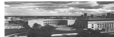
Minnesota Judicial Center, St. Paul